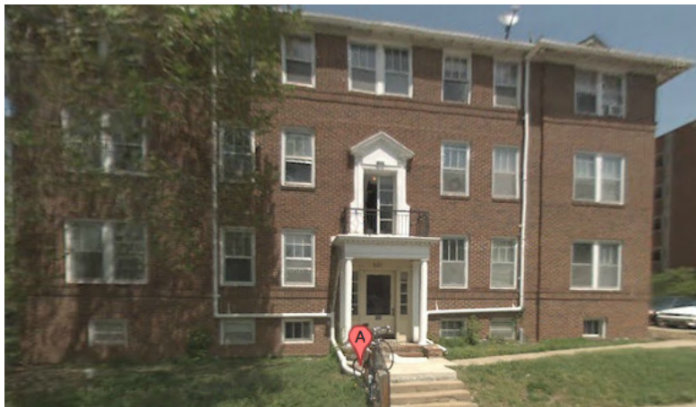
501 Turner Ave: Unofficial house from 2010 to 2012 will be the new official digs for Delta Chi coming fall 2012