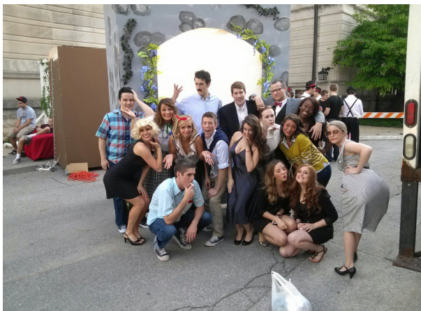
The Cast of Greek Week Skit takes a pic before performing

Change is happening all around the chapter, and in a positive way. Coming this fall, we will have an official house right next to campus for the first time since 2007, complete with common rooms, dining options, and study areas for our members. Also, as Mizzou is moving to the Southeastern Conference, we welcome the new traditions it will bring and the new chapters we will meet.