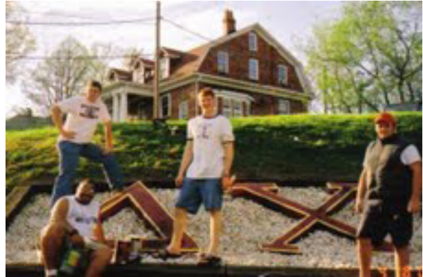
Stewart St. House: 1987 to 2007