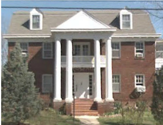
University St. House: 1951 to 1954